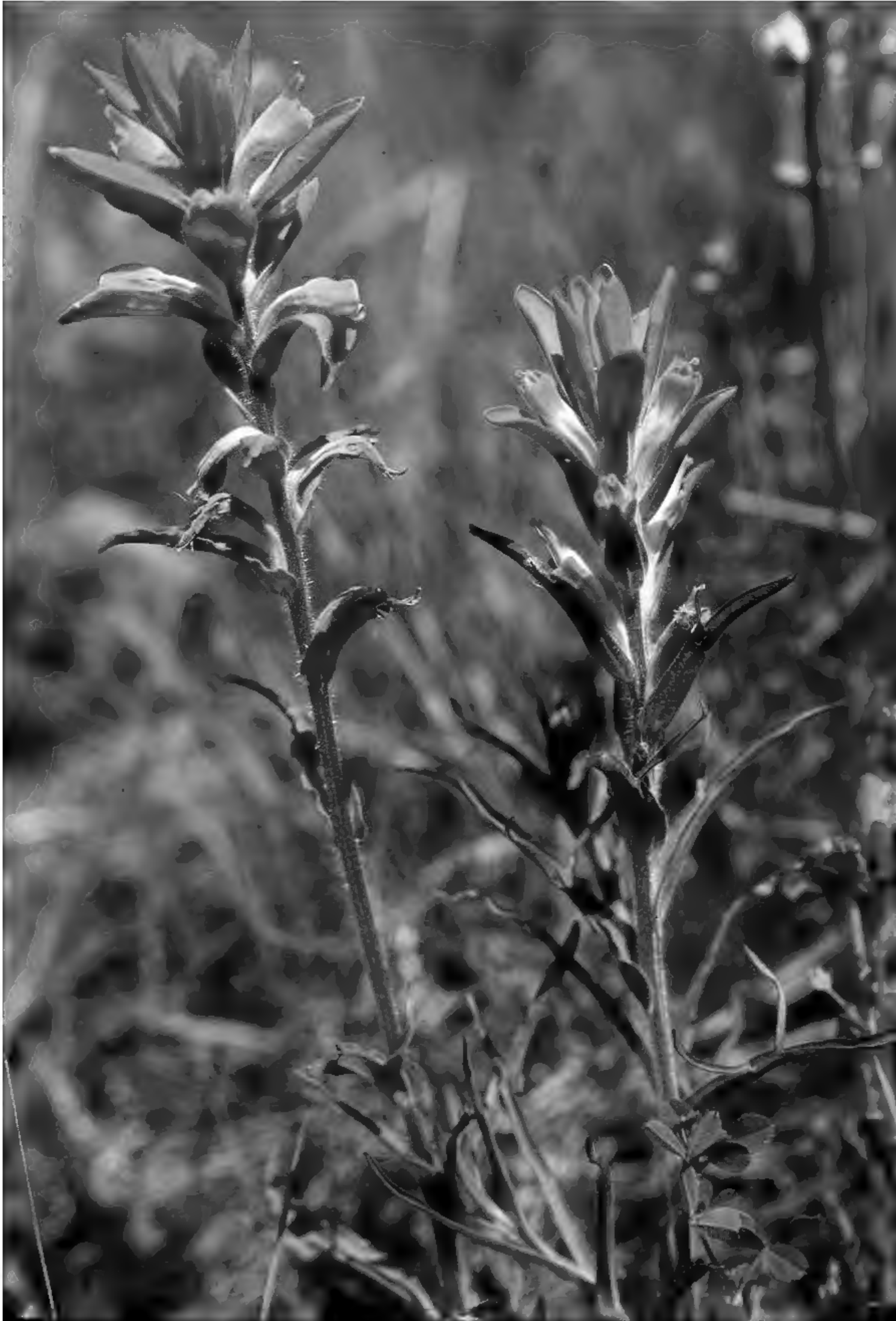
Figure 12. Castilleja indivisa x C. purpurea , presumed F1 hybrid (right) with typical C. indivisa (left), ca. 3 miles east of Brady, McCulloch Co., Texas, 20 Apr 1997. In the hybrid plant, note the deeply divided leaves and relatively longer corolla beaks of C. purpurea and the largely emarginate calyces of C. indivisa , along with the more or less intermediate coloration of the bracts and calyces. The bracts are red like C. indivisa , the purple of C. purpurea apparently not expressed even in intermediacy.